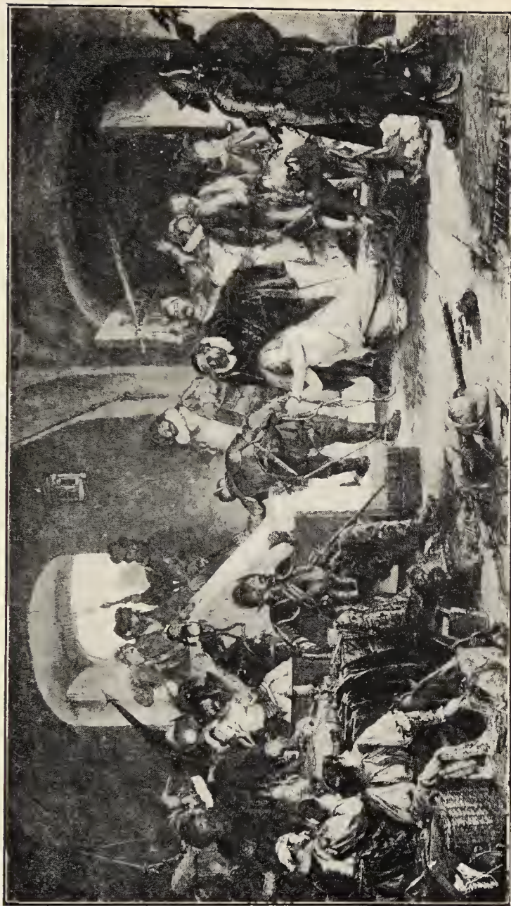
THE SPANISH FURY IN ANTWERP, NOVEMBER 4, 1576